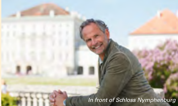
In front of Schloss Nymphenburg

Then turn down the first street on the right, Barer Straße , and you'll find yourself in the very centre of Munich's Kunstareal art district. Head right onto Gabelsberger Straße , passing by the 4 Pinakothek der Moderne (Pinakothek of Modern Art). Turn left, cycling onto Türkenstraße and past the 5 Brandhorst Museum , before turning left again onto Theresienstraße. Crossing Barer Straße, then cycle past the 6 Neue Pinakothek and the Alte Pinakothek .