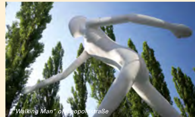
"Walking Man" on Leopoldstraße

500 metres, head left onto Nördliche Auffahrtsallee , along the canal and through the gardens to 11 Schloss Nymphenburg . From the palace, cycle back along the canal for a short stretch, then turn left onto Menzinger Straße . After around 300 metres, cross the Biedersteiner Canal and turn right onto Kuglmüllerstraße . From there, follow the signs for 12 Olympiapark to ride across the large park complex which hosted the 1972 Olympic Summer Games, and which is still used today.